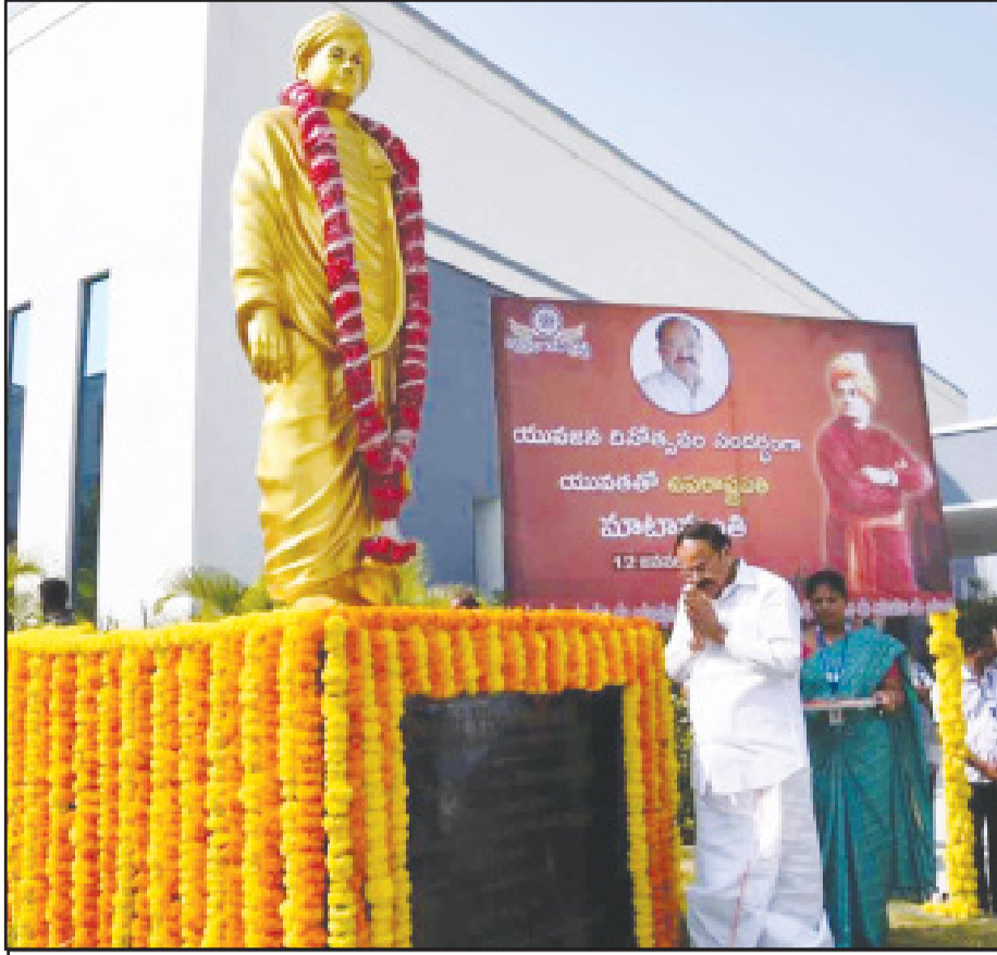
The Vice President, Shri M. Venkaiah Naidu paying homage at the Statue of Swami Vivekananda, at Swarna Bharat Trust, in Muchintal, Hyderabad.