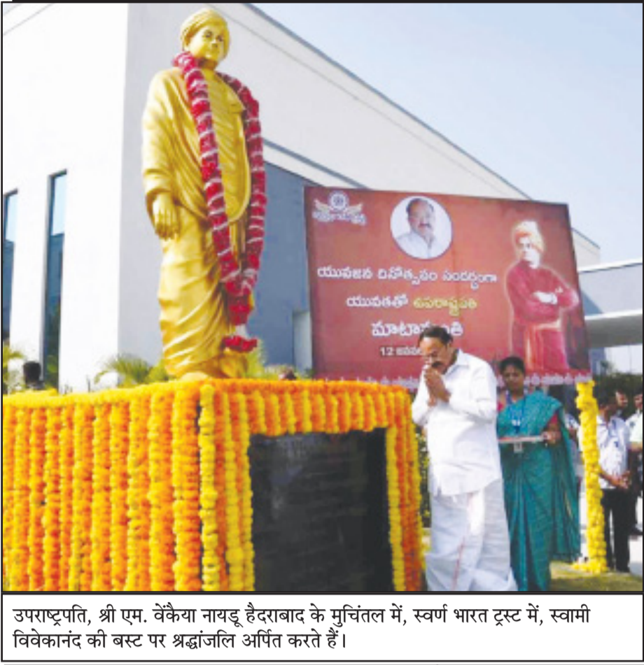
उपराष्ट्रपति, श्री एम. वेंकैया नायडू हैदराबाद के मुचितल में, स्वामी विवेकानंद की बस्ट पर श्रद्धांजलि अर्पित करते हैं।