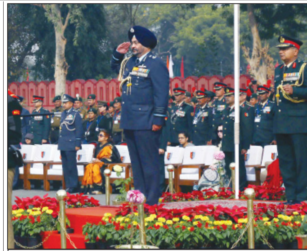
वायु सेना प्रमुख, एयर चीफ मार्शल बी.एस. धनोआ ने नई दिल्ली में एनसीसी गणतंत्र दिवस शिविर 2019 में भाग लेने वाले एनसीसी कैडेट्स द्वारा प्रस्तुत सलामी प्राप्त की।

जो गाय के नाम पर वोट मांगते हैं उन्हें चारा भी देना चाहिए : केजरीवाल ने शुक्रवार को कहा कि जो लोग गाय के नाम पर वोट मांगते हैं उन्हें उनके लिए चारा भी उपलब्ध कराना चाहिए। उन्होंने यह टिप्पणी तब की जब उन्हें बवाना के दौरे में बताया गया कि भाजपा के नेतृत्व वाली एमसीडी ने दो साल से इलाके में एक गोशाला को फंड जारी नहीं किया है। मुख्यमंत्री केजरीवाल ने शुक्रवार को मंत्री गोपाल राय के साथ उत्तर-पश्चिम जिले के बवाना में दिल्ली सरकार तथा नगर निगम द्वारा वित्त पोषित 'श्री कृष्ण गोशाला' का दौरा किया। गोशाला के दौरे के बाद केजरीवाल ने पत्रकारों से कहा कि आम आदमी पार्टी (आप) गाय के नाम पर वोट नहीं मांगती। गोशाला के प्रतिनिधियों ने केजरीवाल को बताया कि भाजपा शासित एमसीडी ने दो वर्षों से अपने हिस्से के फंड जारी नहीं किए हैं। इसकी वजह से उन्हें दिक्कतें आ रही हैं। केजरीवाल ने दावा किया कि दिल्ली सरकार ने गोशाला को अपने हिस्से की निधि जारी कर दी है, लेकिन एमसीडी ने अभी तक अपना हिस्सा नहीं दिया। मुख्यमंत्री ने कहा कि जो गाय के नाम पर वोट मांगते हैं उन्हें गायों को चारा भी देना चाहिए। उन्होंने किसी का नाम लिए बगैर पत्रकारों से कहा कि उन्हें गायों के नाम पर वोट मिलते हैं, लेकिन वे गायों को चारा देने से इनकार करते हैं, जो सही नहीं है। गायों पर राजनीति नहीं की जानी चाहिए। उन्होंने कहा कि मंत्री गोपाल राय और आप सरकार ने हाल ही में पशुओं और पशुओं के लिए एक नीति पेश की है। घुमन हेड़ा इलाके में एक गोशाला का आधुनिकीकरण किया जाएगा। श्री कृष्ण गोशाला 36 एकड़ से अधिक क्षेत्र में फैली है। इसमें 7,740 मवेशी रखे जाने की क्षमता है और वहां 7,552 मवेशी हैं।