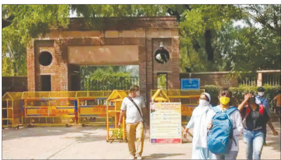
डीयू की ओर से दाखिल याचिका पर आदेश दिया था। दिल्ली सरकार ने उसके द्वारा वित्त पोषित 12 कॉलेजों को अपने शिक्षकों व कर्मचारियों को छात्र निधि से वेतन देने का निर्देश दिया था।